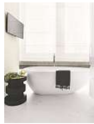
HIBOU DESIGN & CO.

An upholstered banquette with drawers or cubbyholes