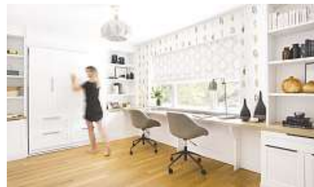
HIBOU DESIGN & CO.

A Murphy bed with storage transforms this home office into a multifunctional space, helping professionals remain on task while also making overnight guests feel right at home.